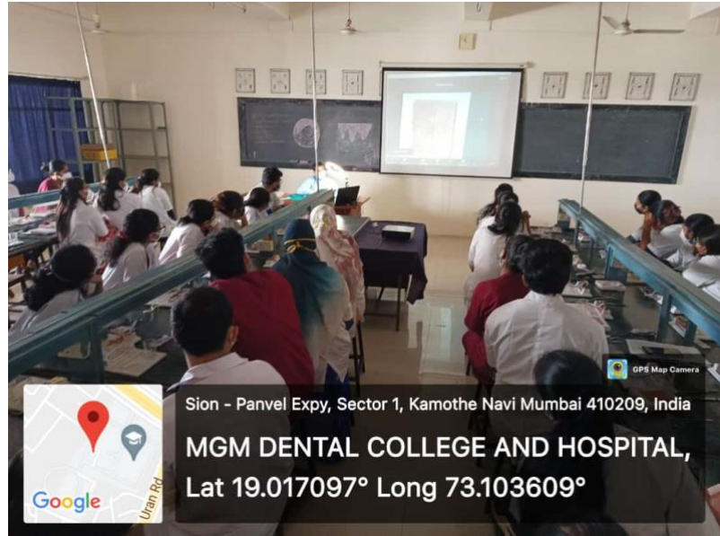
Sion - Panvel Expy, Sector 1, Kamothe Navi Mumbai 410209, India MGM DENTAL COLLEGE AND HOSPITAL, Lat 19.017097° Long 73.103609°