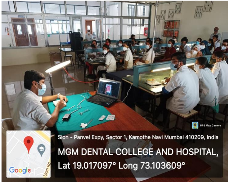
Sion - Panvel Expy, Sector 1, Kamothe Navi Mumbai 410209, India MGM DENTAL COLLEGE AND HOSPITAL, Lat 19.017097° Long 73.103609°