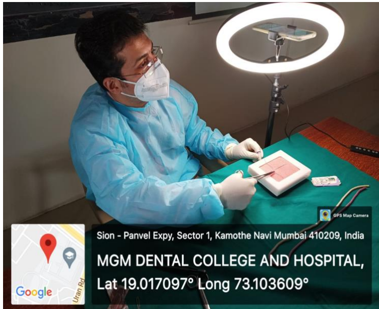
Sion - Panvel Expy, Sector 1, Kamothe Navi Mumbai 410209, India MGM DENTAL COLLEGE AND HOSPITAL, Lat 19.017097° Long 73.103609°