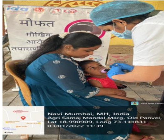
TEAM MEMBERS AT THE CAMP SITE