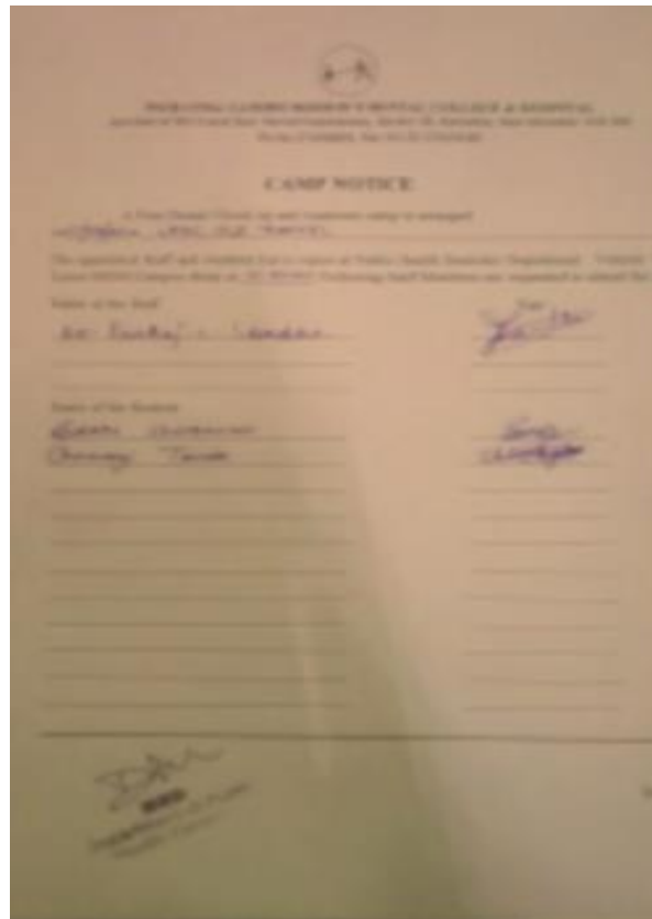
List of attendees