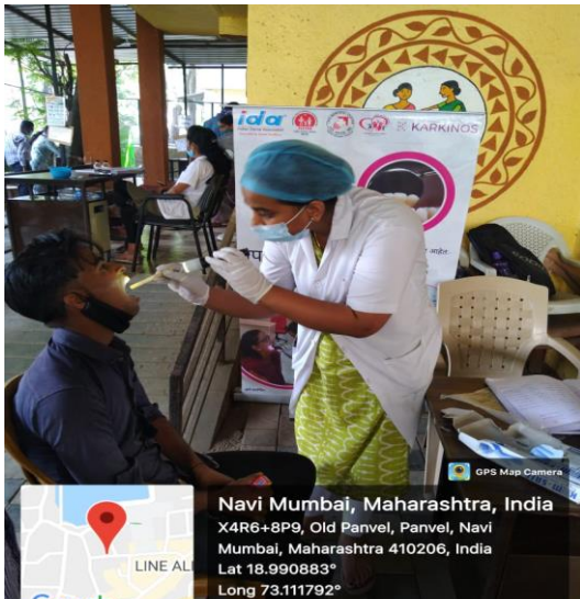
TEAM MEMBERS AT THE CAMP SITE