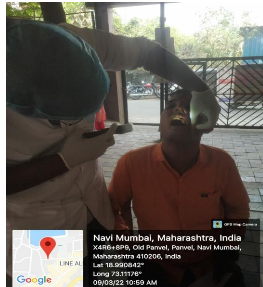
INVESTIGATION BEING DONE BY THE TEAM MEMBER