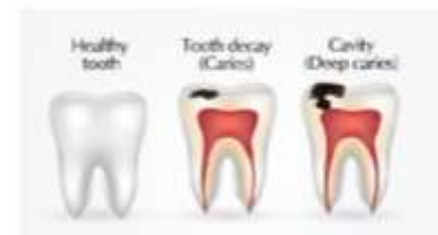
Screenshot of Presentation