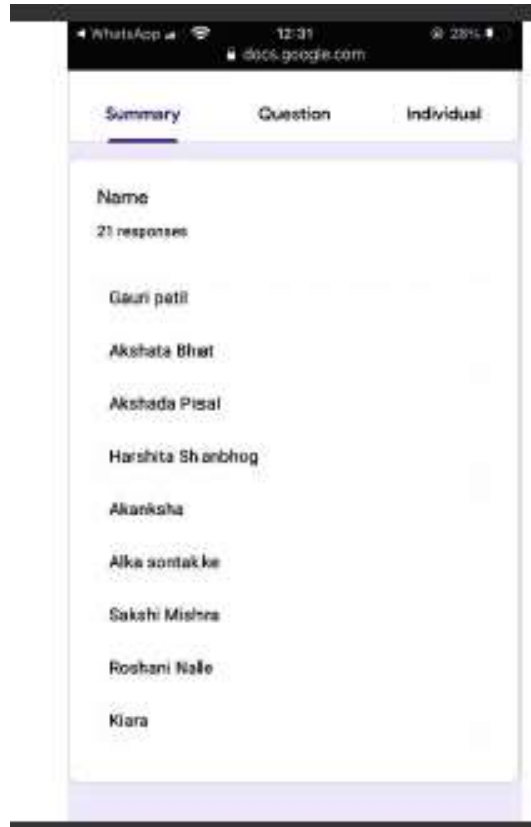
Screenshot of List of Attendees