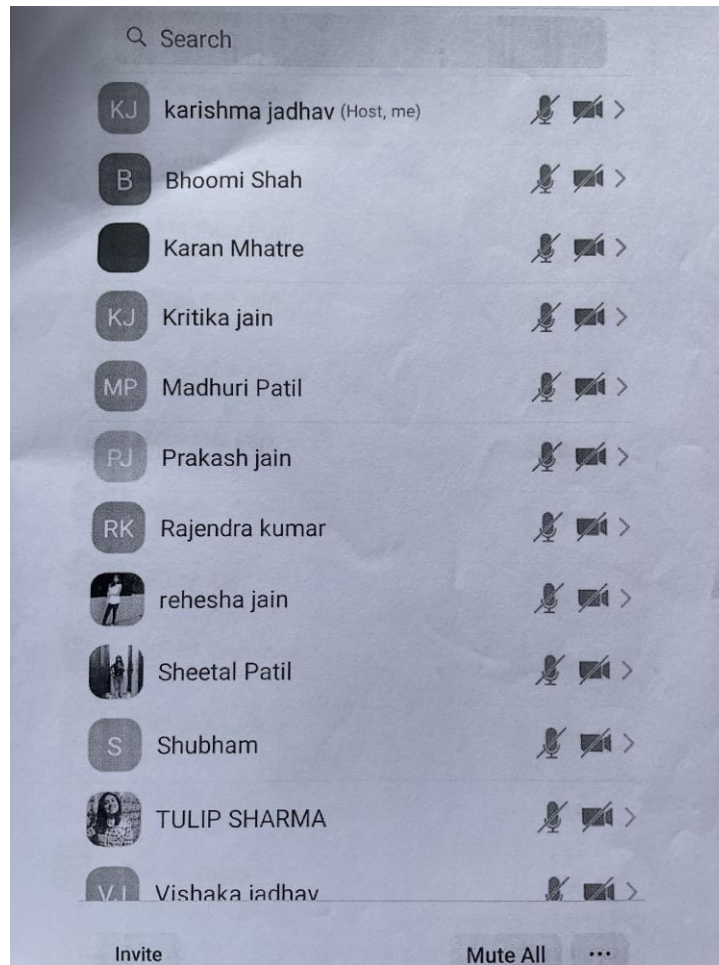
Screenshot of Attendees