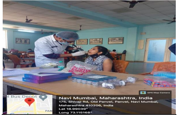
INVESTIGATION BEING DONE BY THE TEAM MEMBER