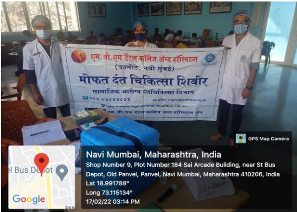
TEAM MEMBERS AT THE CAMP SITE