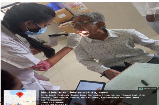
TEAM MEMBERS AT THE CAMP SITE