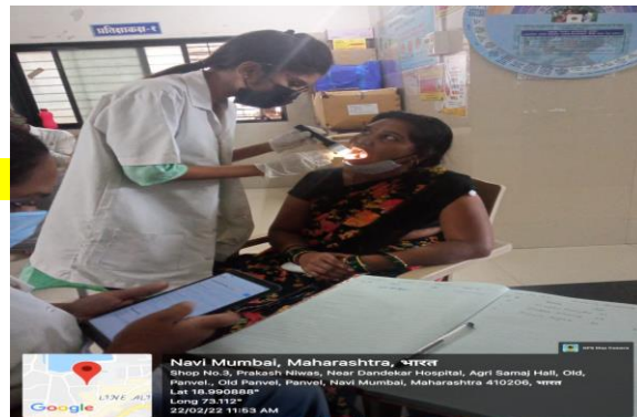
INVESTIGATION BEING DONE BY THE TEAM MEMBER