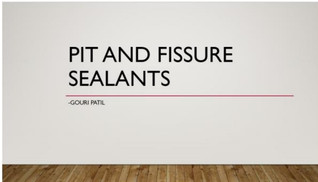
Screenshot of Presentation

Thus, similar kind of activity was extended to Canara bank, Vidyavihar. The activity involved a detailed talk on Pit & Fissure sealants. Online session was conducted by speaker Gouri Patil. The session included a high level of interaction between the participants & the speaker. The speaker used evidentiary support with varied AV aids to educate the participants.