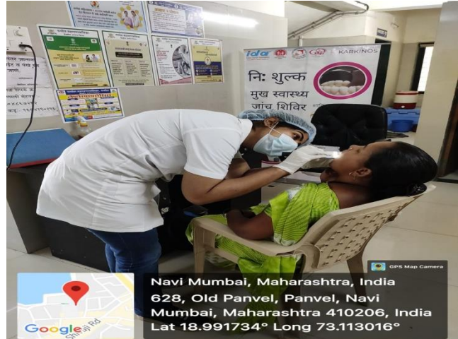
TEAM MEMBERS AT THE CAMP SITE

Navi Mumbai, Maharashtra, India 628, Old Panvel, Panvel, Navi Mumbai, Maharashtra 410206, India Lat 18.991734° Long 73.113016°