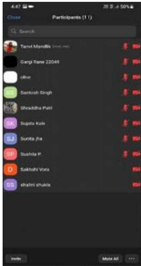
Screenshot of Attendees