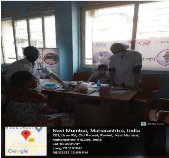
TEAM MEMBERS AT THE CAMP SITE