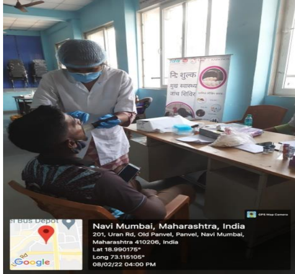
INVESTIGATION BEING DONE BY THE TEAM MEMBER