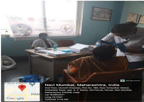
TEAM MEMBERS AT THE CAMP SITE