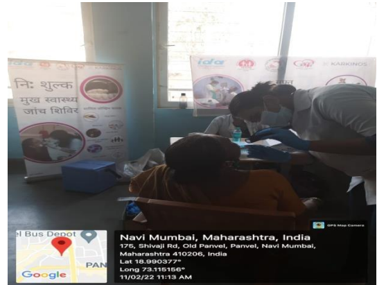
INVESTIGATION BEING DONE BY THE TEAM MEMBER