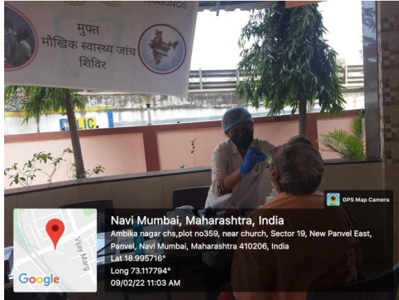
INVESTIGATION BEING DONE BY THE TEAM MEMBER