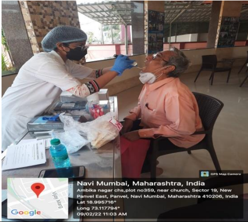
TEAM MEMBERS AT THE CAMP SITE