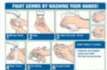
Screenshot of Presentation