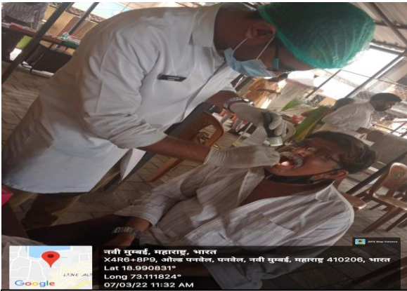
TEAM MEMBERS AT THE CAMP SITE