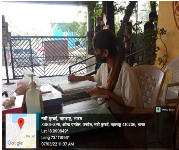
INVESTIGATION BEING DONE BY THE TEAM MEMBER