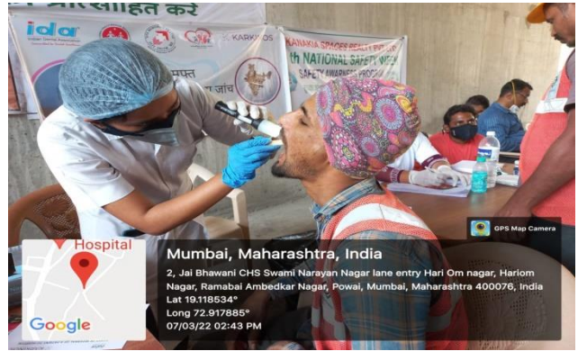
TEAM MEMBERS AT THE CAMP SITE