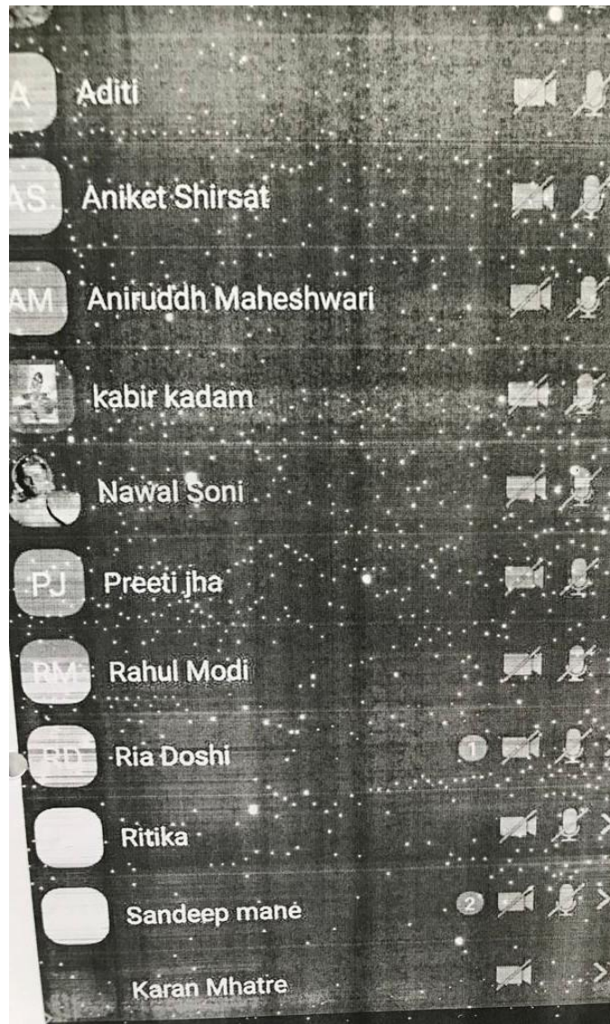
Screenshot of Attendees