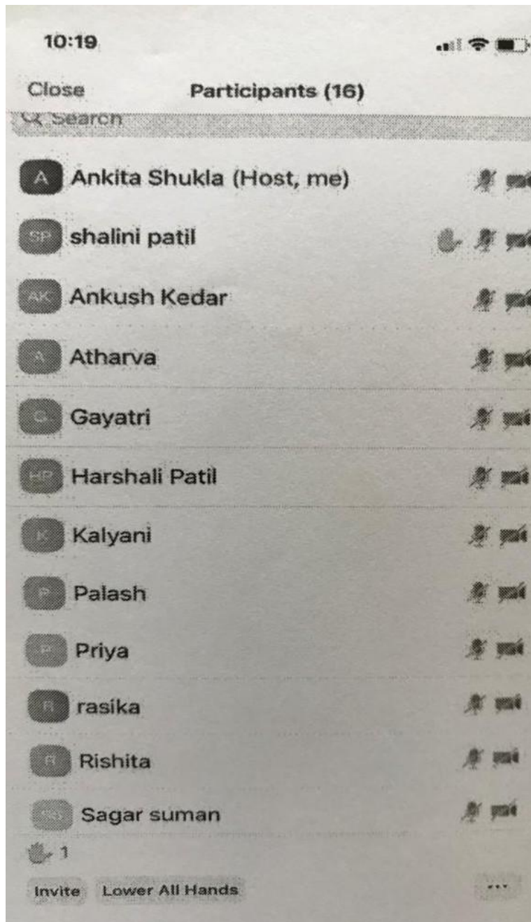
Screenshot of Attendees