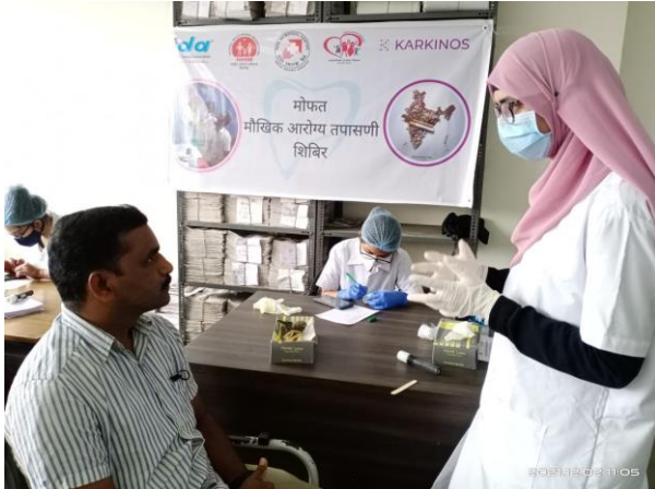
Team member counselling the patient regarding maintenance of good oral hygiene