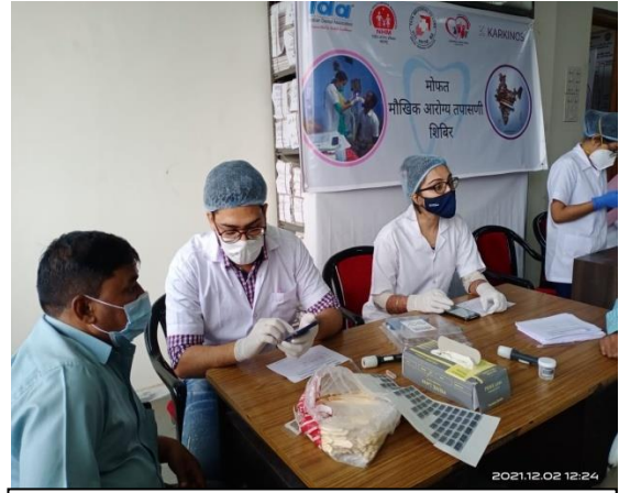
Orientation of the patient towards good oral hygiene being done by team member