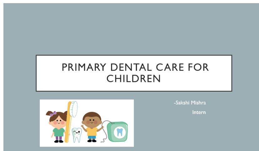
Screenshot Of Presentation

Thus, similar kind of activity was extended to participants at Royal Residency Ulhasnagar. The activity involved a detailed talk on Primary Teeth care in Young Mothers. Online session was conducted by speaker Sakshi Mishra. The session included a high level of interaction between the participants & the speaker. The speaker used evidentiary support with varied AV aids to educate the participants.