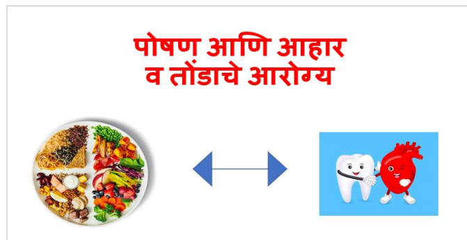
Screenshot of Presentation

Thus, similar kind of activity was extended to participants of Tulsi Harmony CHS, Sector-01, Khanda colony, New Panvel. The activity involved a detailed talk on Diet & Nutrition and Oral Health. Online session was conducted by speaker Snehal Bergal. The session included a high level of interaction between the participants & the speaker. The speaker used evidentiary support with varied AV aids to educate the participants.