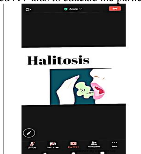
Screenshot of presentation

Thus, similar kind of activity was extended to Ramai Gas Service. The activity involved a detailed talk on Halitosis. Online session was conducted by speaker Swapnali. The session included a high level of interaction between the participants & the speaker. The speaker used evidentiary support with varied AV aids to educate the participants.