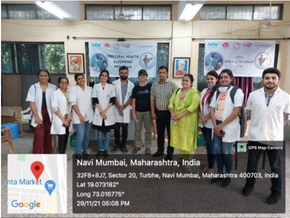
Team and Staff Members The Camp Site