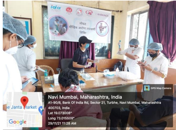
Nurses Performing Oral Health Screening at The Camp Site