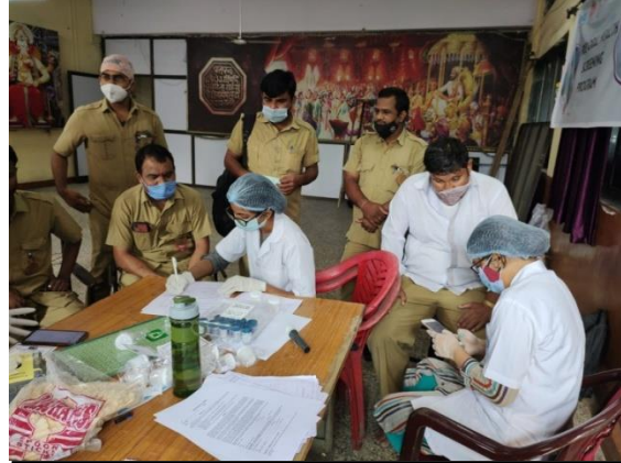
TEAM MEMBERS PERFORMING HEALTH CHECKUP AT THE CAMP SITE