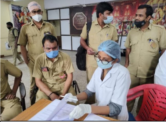
BUS DEPOT STAFF PRESENT AT THE CAMP SITE FOR ORAL HEALTH CHECK UP