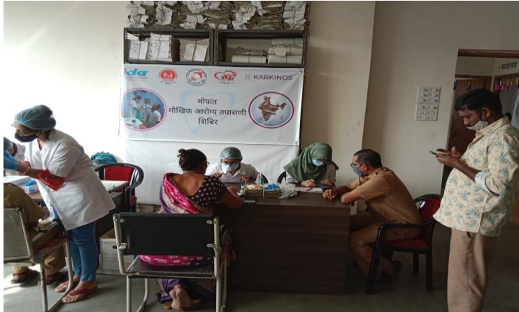
TEAM MEMBERS AT THE CAMP SITE