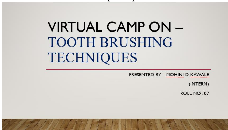
Screenshot Of Presentation

Thus, similar kind of activity was extended to participants of Mayuresh Apartment CHS, Thane. The activity involved a detailed talk on Awareness about Tooth Brushing Techniques. Online session was conducted by speaker Mohini Kavale. The session included a high level of interaction between the participants & the speaker. The speaker used evidentiary support with varied AV aids to educate the participants.