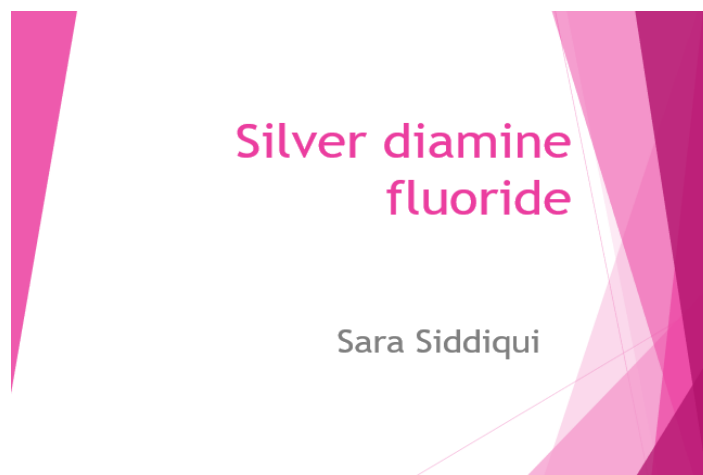
Screenshot of Presentation

Thus, similar kind of activity was extended to participants of Gangotri Co-op Hsg Society, Nerul. The activity involved a detailed talk on Silver Diamine Fluoride. Online session was conducted by speaker Sara Siddiqui. The session included a high level of interaction between the participants & the speaker. The speaker used evidentiary support with varied AV aids to educate the participants.