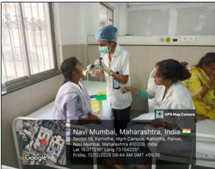
Investigations done by the Dental Team

The camp revealed that out of 35 individuals, 13 had dental caries, 2 had over retained deciduous teeth, 8 had root pieces and others had calculus and stains. It was observed that there is limited awareness regarding the importance of regular dental check-ups among the community, particularly among antenatal patients. Misconceptions and lack of knowledge often lead individuals to neglect preventive dental care until symptoms become severe. In conclusion, the camp successfully highlighted the importance of regular dental check-ups and preventive oral care.