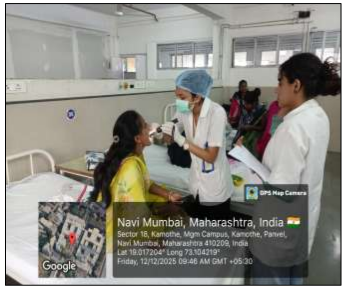
Investigations done by the Dental Team