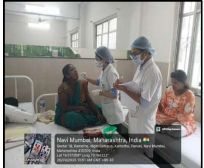
Oral examination at the camp site