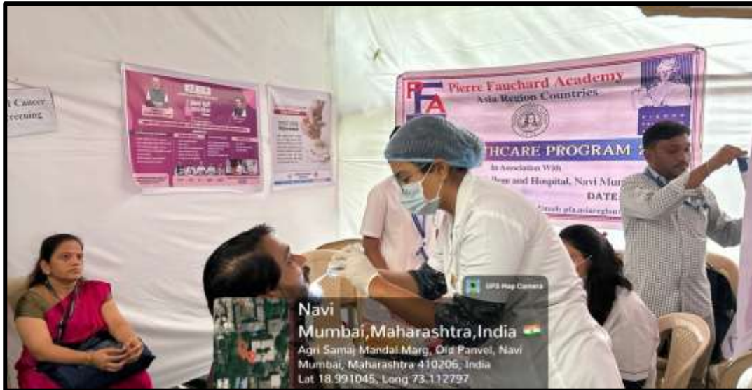
Oral examination at the camp site

participants' understanding of oral health risks and the importance of adopting healthy habits. By addressing common issues like caries, gingivitis, and harmful lifestyle choices, the camp helped adolescents recognise the value of regular dental check-ups, proper brushing, and balanced diet. Overall, the camp effectively combined screening with impactful health education. Strengthening such initiatives can empower adolescents to take responsibility for their oral health, reduce disease burden, and promote better oral health outcomes within the community.