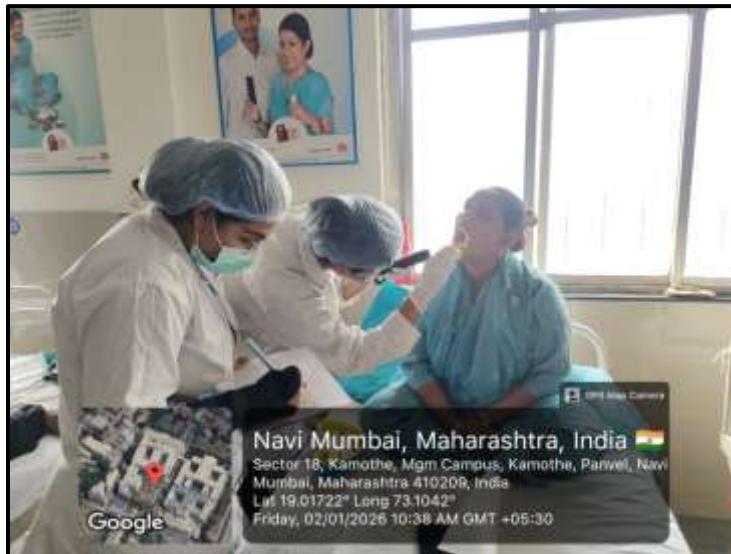
ORAL EXAMINATION DONE AT CAMP SITE BY THE TEAM MEMBER

Oral health education and prevention strategies should be implemented in order to reduce the disease burden among these pregnant ladies and their better well being