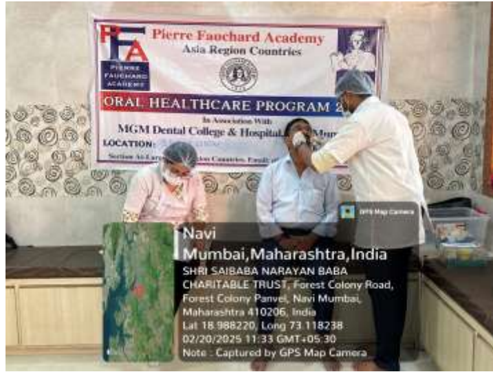
Oral examination at the camp site