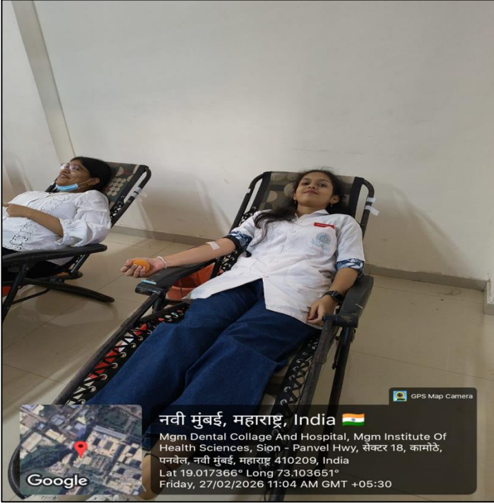
Students Of MGDMDCH joining the drive.