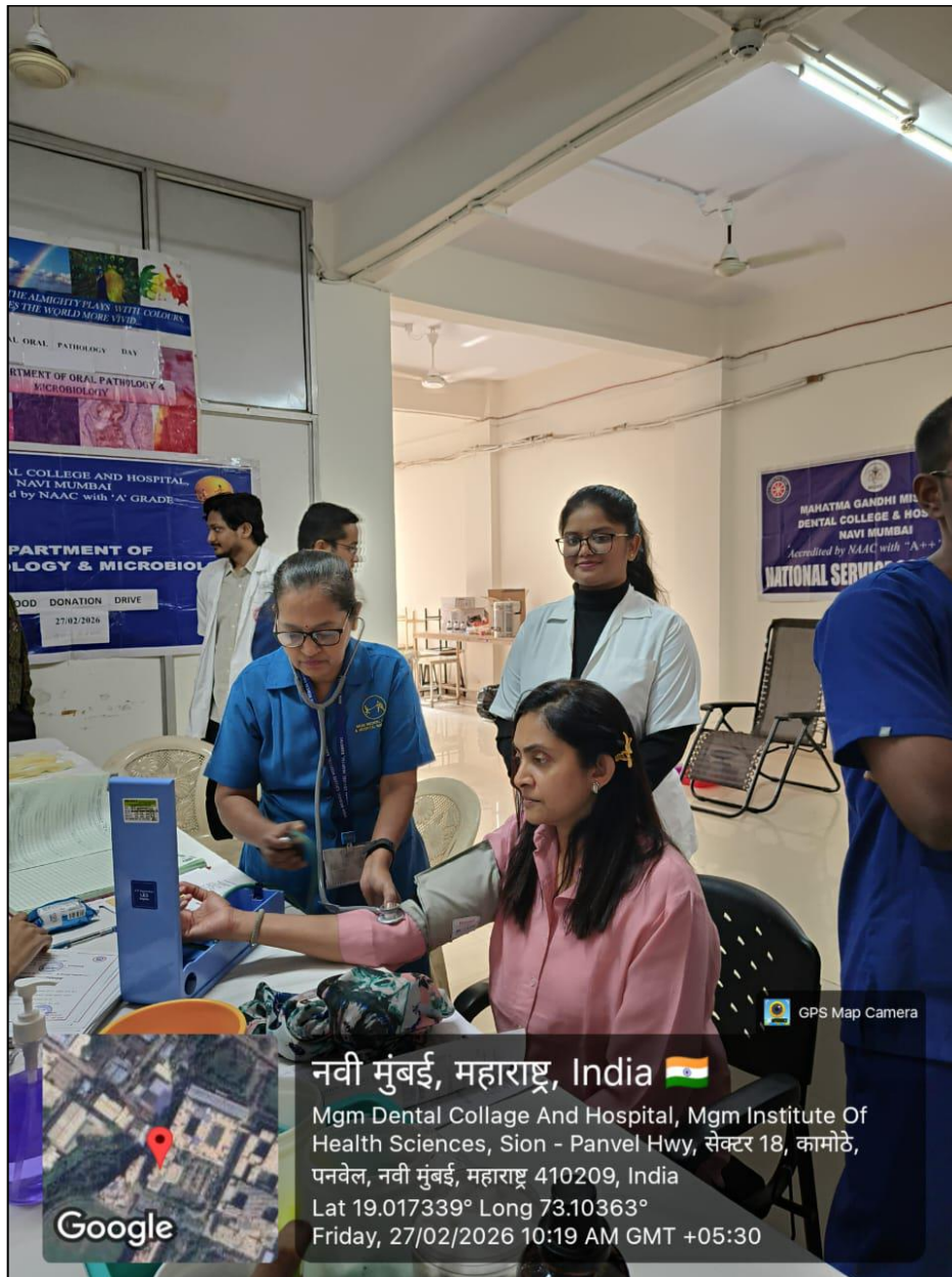
Faculty Members on MGDCH taking part in the blood donation drive organised by NSS Unit of MGDCH.