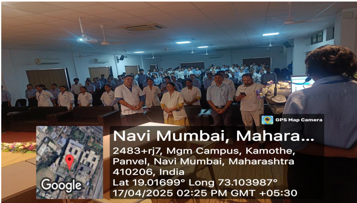
Pledge taken in order to pay respect to Dr. Babasaheb Ambedkar at MGMDCH.