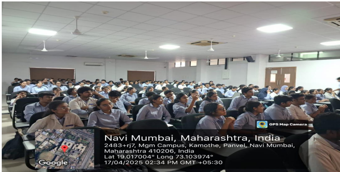
1st and 2nd year students engrossed in the debate.