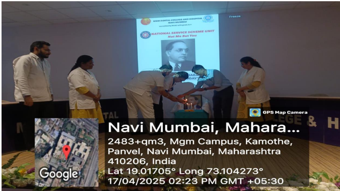
Lamp lighting ceremony by the Judges at MGMDCH.