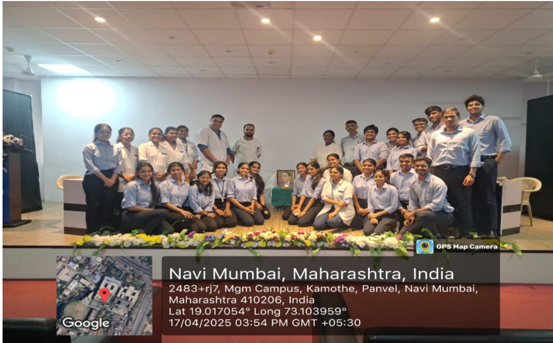
NSS volunteers after and judges panel after the debate at MGMDCH.