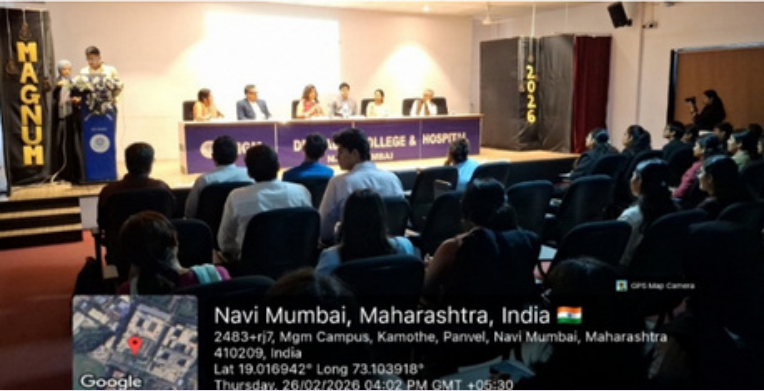
Navi Mumbai, Maharashtra, India 2483+rj7, Mgm Campus, Kamothe, Panvel, Navi Mumbai, Maharashtra 410209, India Lat 19.016942° Long 73.103918° Thursday, 26/02/2026 04:02 PM GMT +05:30