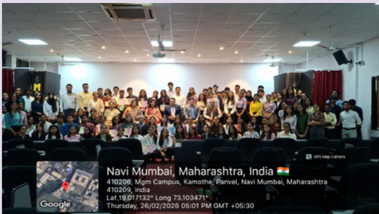
Navi Mumbai, Maharashtra, India 410206, Mgm Campus, Kamothe, Panvel, Navi Mumbai, Maharashtra 410209, India Lat 19.017132° Long 73.103471° Thursday, 26/02/2026 05:01 PM GMT +05:30