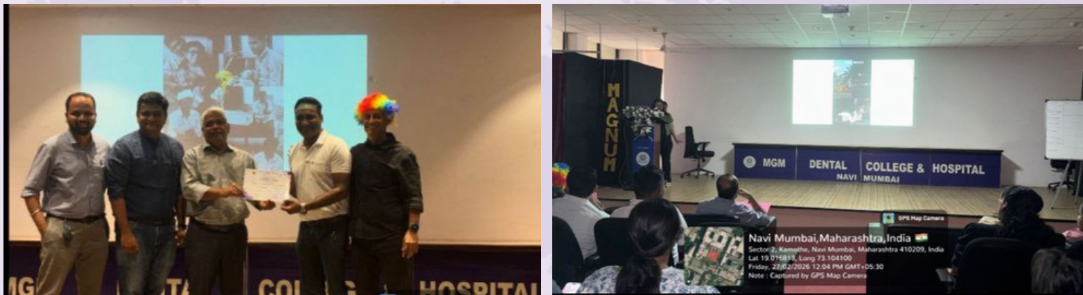
Photo Voice Contest

The Pixel Committee of MGMDCH, Navi Mumbai conducted a PHOTO VOICE CONTEST on occasion of MAGNUM 2026. The event aimed to introduce a new and creative concept of photography where participants expressed powerful stories and perspectives through their photographs.