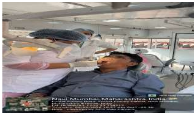
Oral examination at the camp site