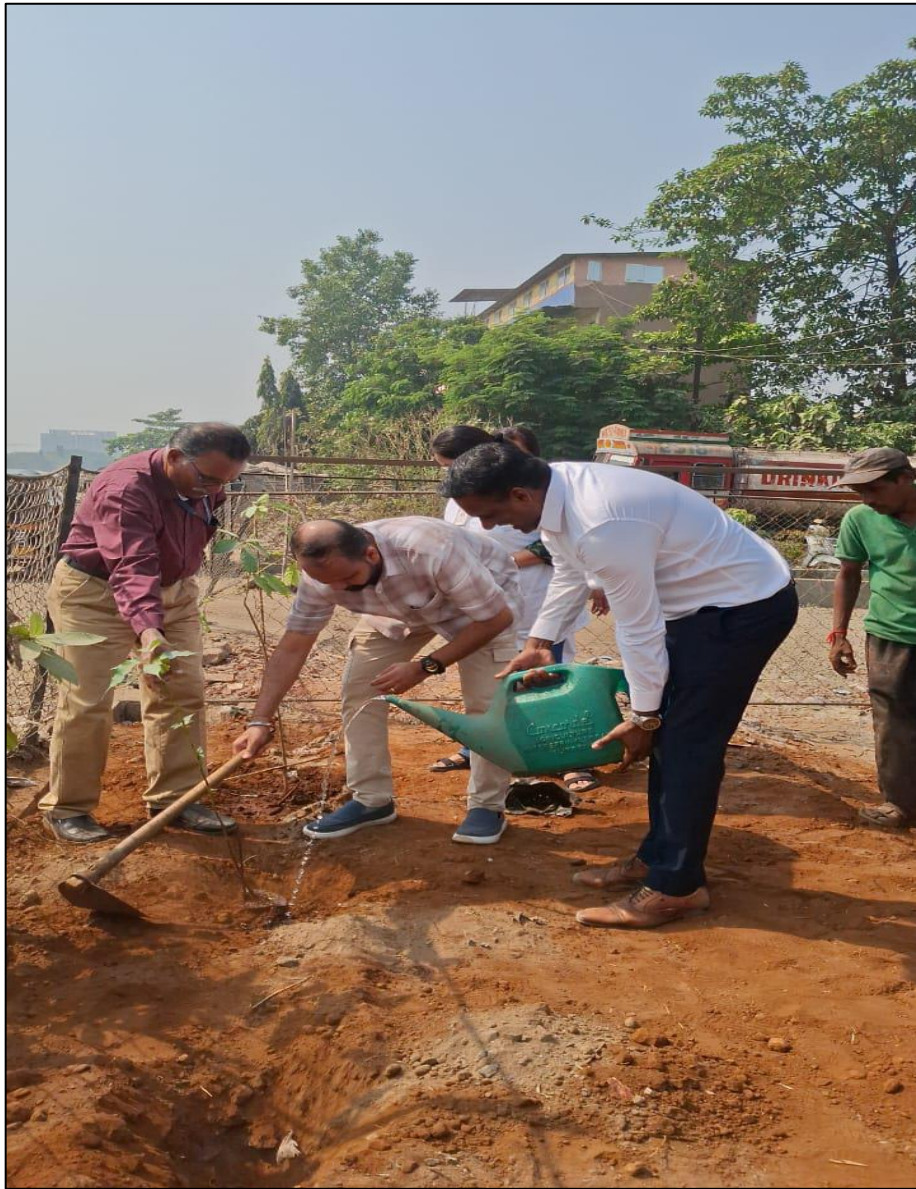
NSS PROGRAM OFFICERS planting the trees to commence the event.