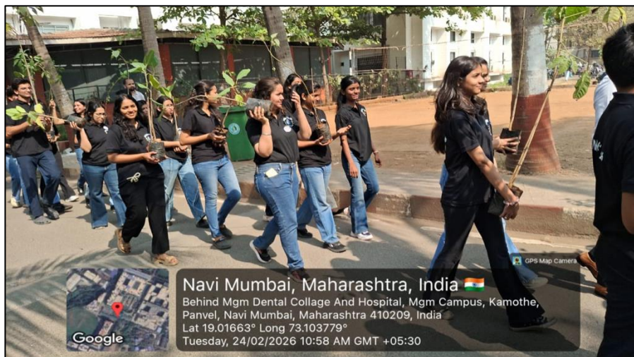
NSS Volunteers all ready to make the environment a better place by planting the trees.