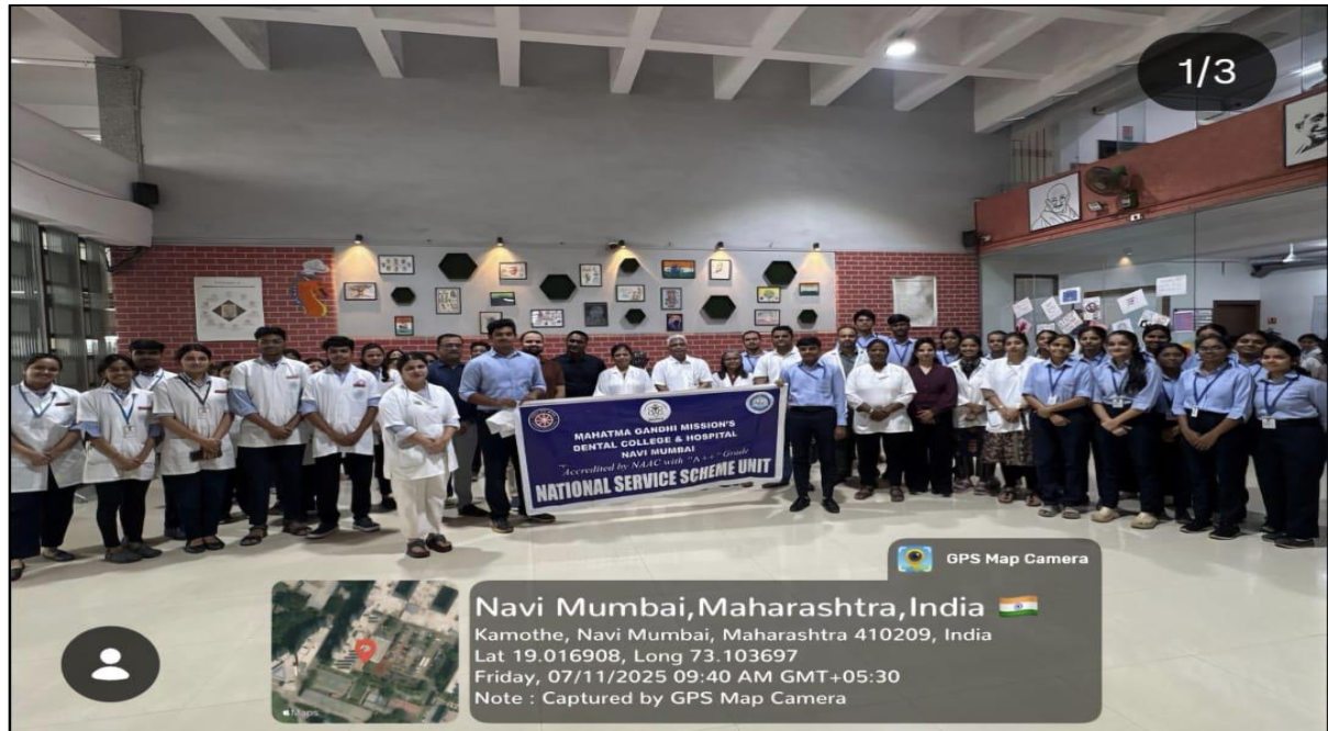
NSS VOLUNTEERS WITH THE NSS PROGRAM OFFICERS.