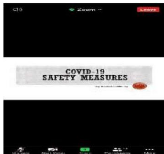
Screenshots of Presentation

Thus, similar kind of activity was extended to participants of Savita Sadan CHSL, Jogeshwari. The activity involved a detailed talk on Covid – 19 Safety Measures. Online session was conducted by speaker Ritiksha Shetty. The session included a high level of interaction between the participants & the speaker. The speaker used evidentiary support with varied AV aids to educate the participants.