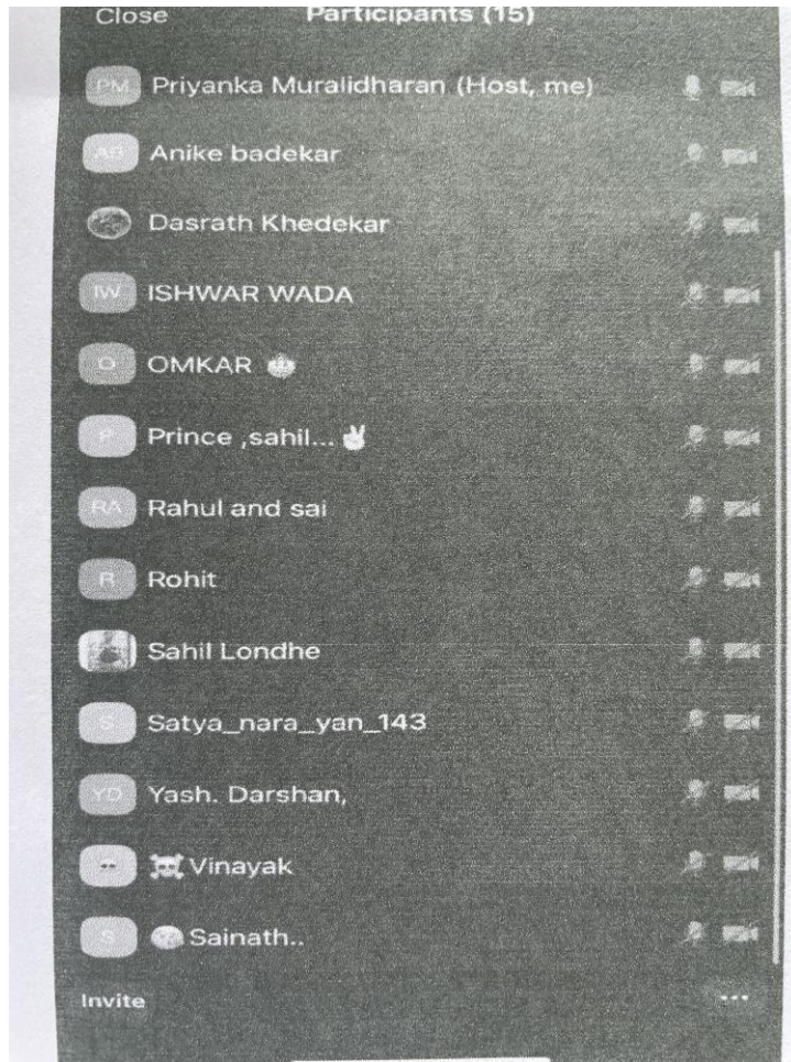
Screenshot of Attendees