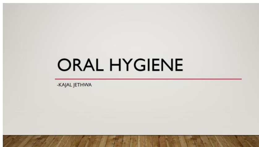
Screenshot of Presentation