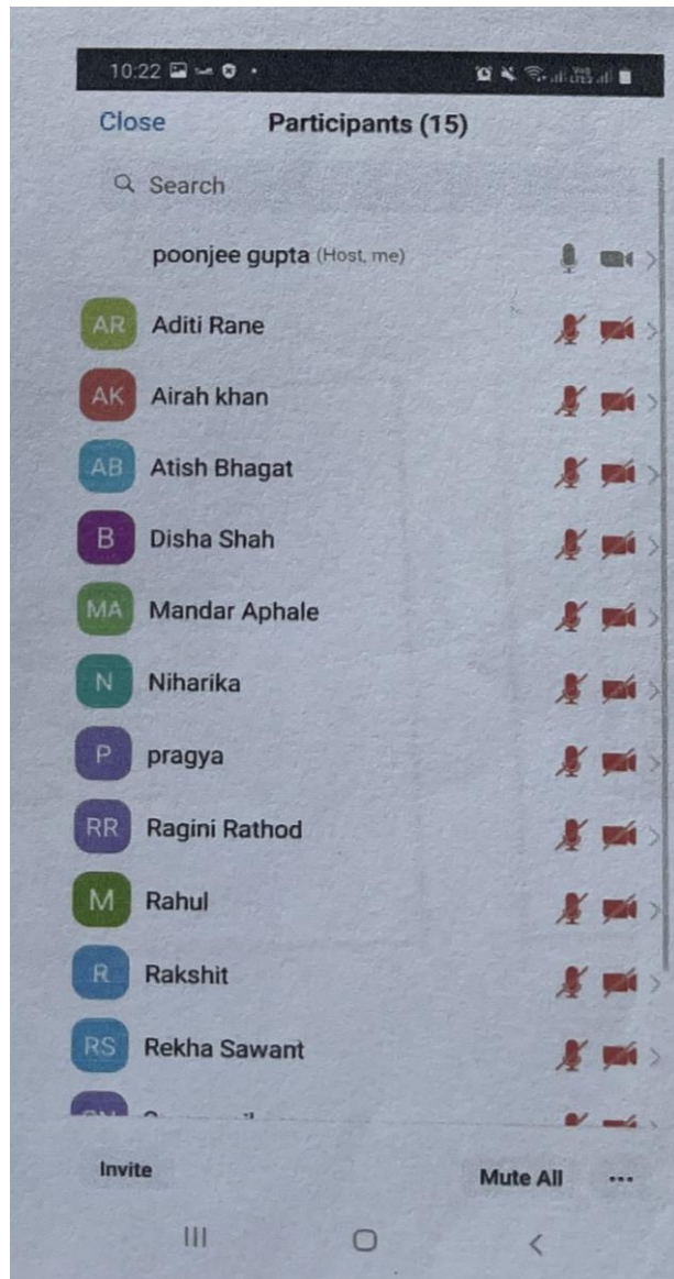
Screenshot of Attendees