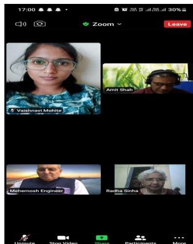
Screenshot of presentation