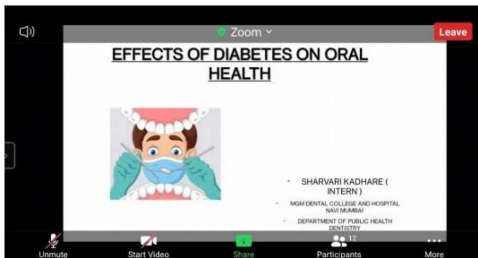
Screenshot of Presentation