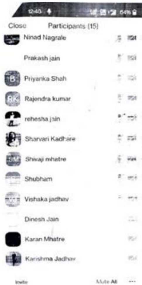
Screenshot of Attendees