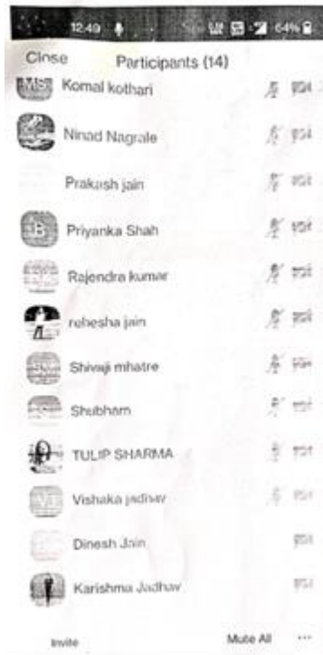
Screenshot of Attendees