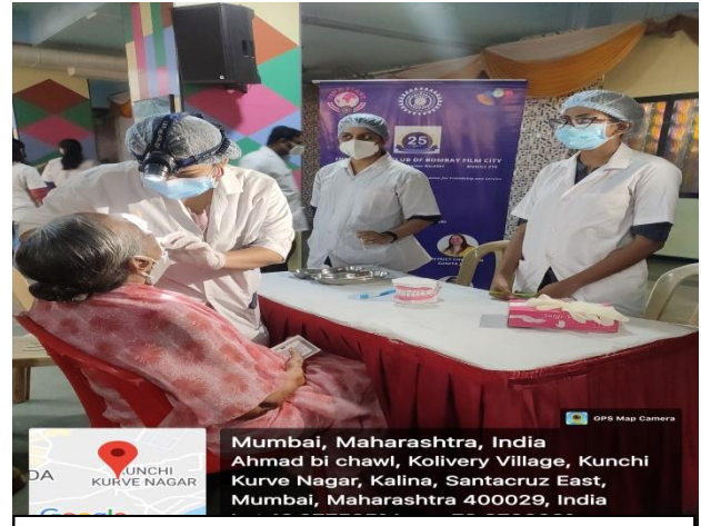
TEAM MEMBERS AT THE CAMP SITE

Mumbai, Maharashtra, India Block-A3, Rizvi Residency, Kolivery Village, Kunchi Kurve Nagar, Kalina, Santacruz East, Mumbai, Maharashtra 400029, India Lat 19.078684° Long 72.869908° 27/02/22 12:57 PM