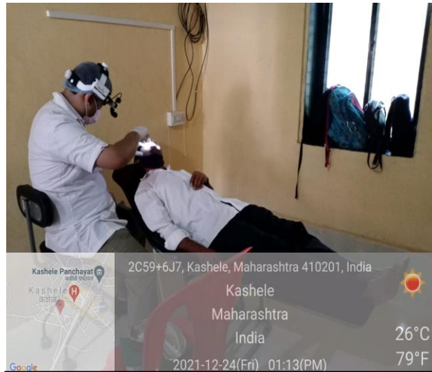
Treatment done at camp site