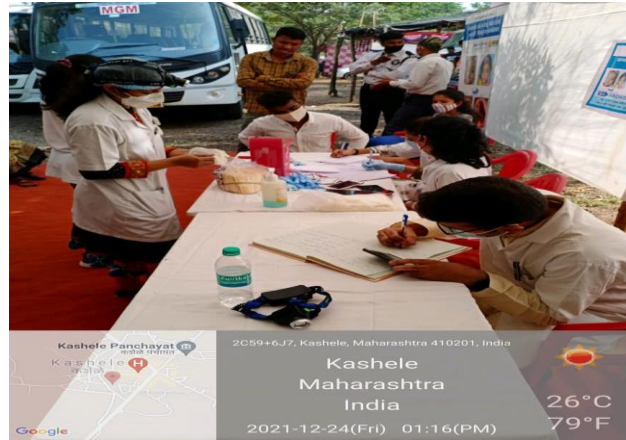
Orientation of the patient towards good oral hygiene being done by team member