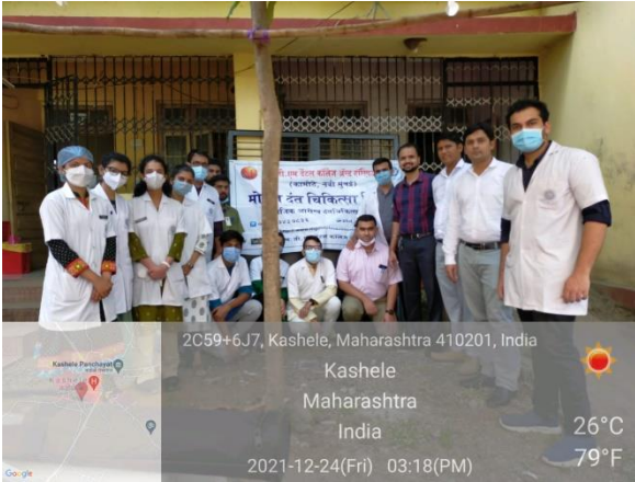
Team member counselling the patient regarding maintenance of good oral hygiene