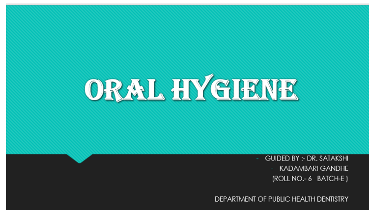
Screenshot of Presentation

Thus, similar kind of activity was extended to participants of Ulka Apartment, Ambernath. The activity involved a detailed talk on Awareness about Oral Hygiene. Online session was conducted by speaker Kadambari Gandhe. The session included a high level of interaction between the participants & the speaker. The speaker used evidentiary support with varied AV aids to educate the participants.